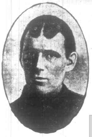
From Peterborough Advertiser, 13/1/1917