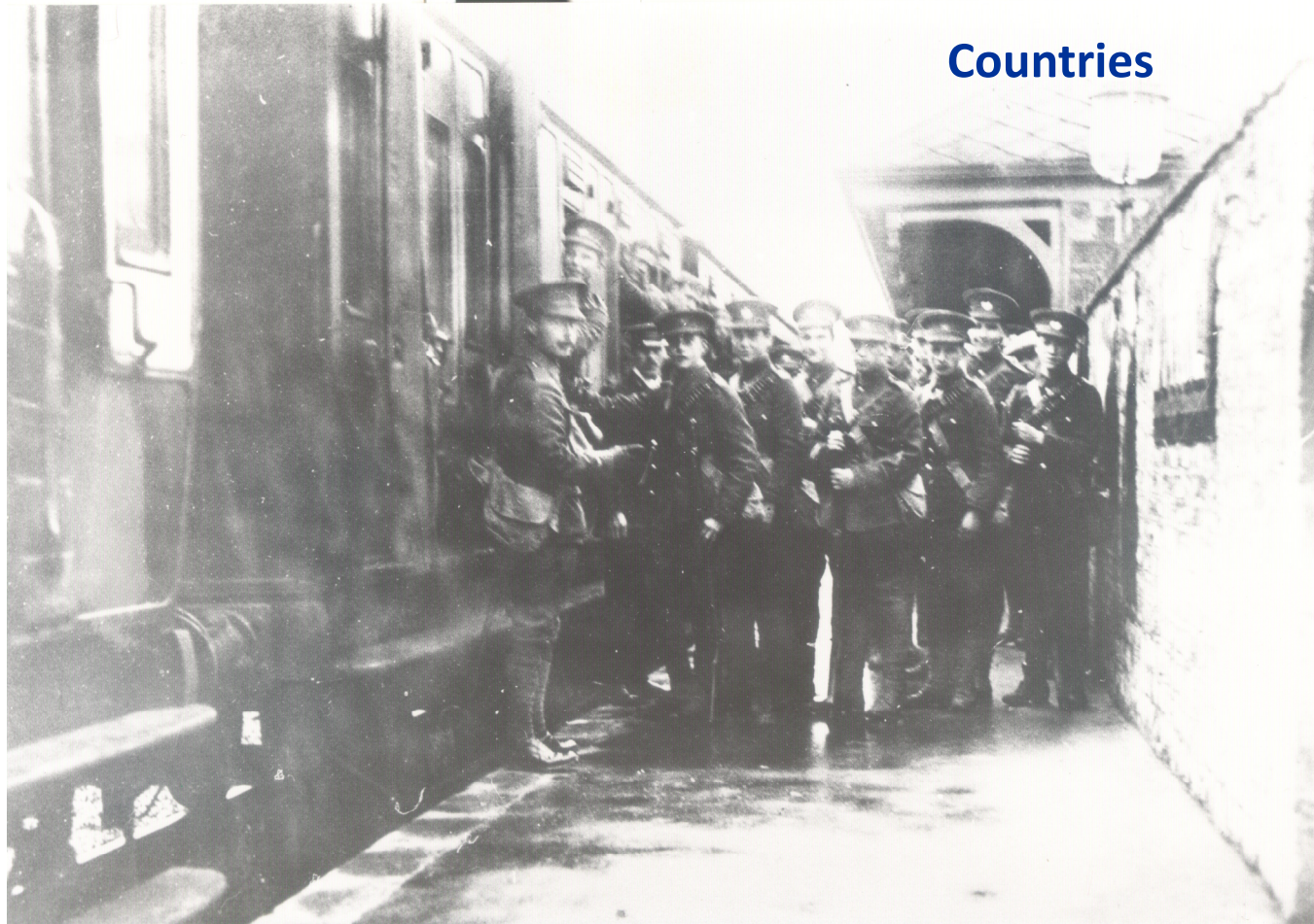
Men of Oundle Leaving for War. From Peterborough Museum (CG127)