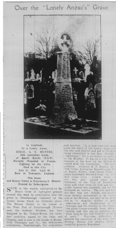
From Peterborough Advertiser, 5/5/1917