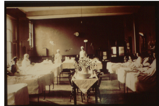
Infirmary Ward, Peterborough. From Peterborough Museum Collection GP VOT